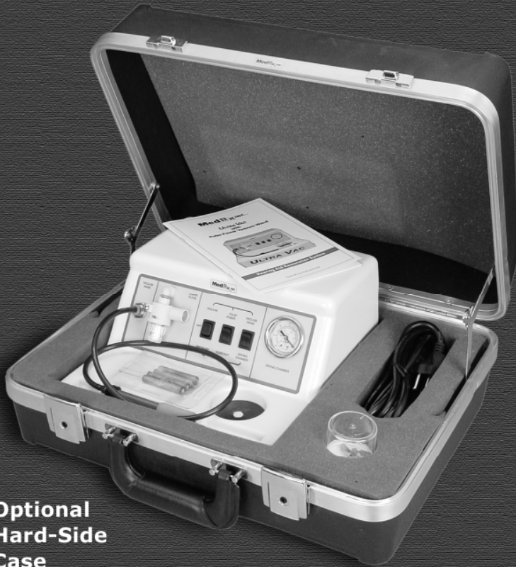
Optional Hard-Side Case

The extremely quiet UltraVac features Pulse Power that effectively increases the level of pulling power through the vacuum wand